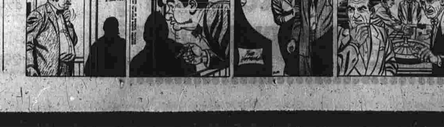
THE STORY OF MARTHA WAYNE