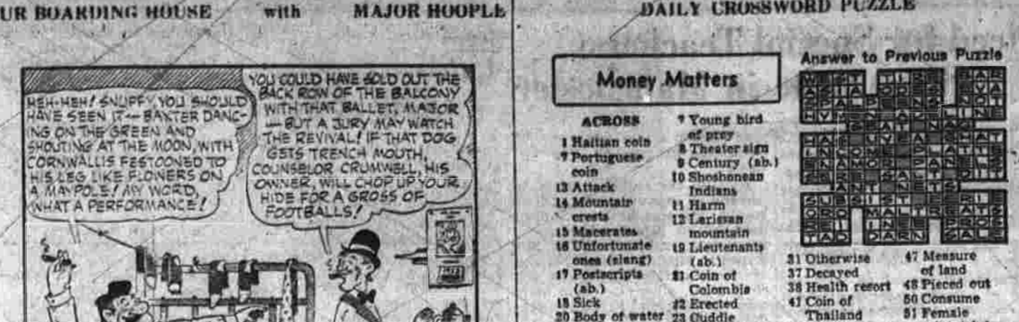
OUR BOARDING HOUSE