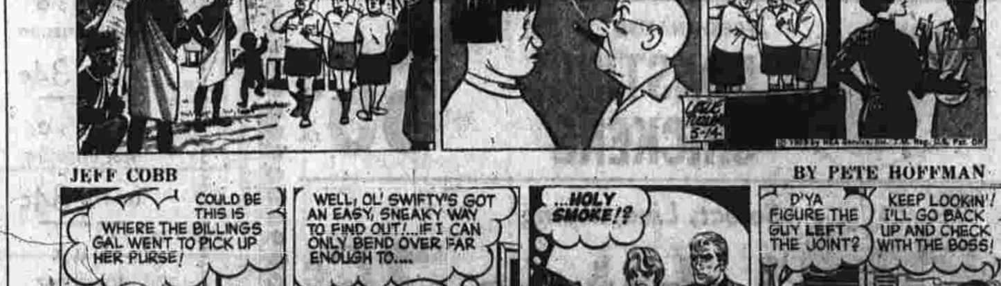
THE STORY OF MARTHA WAYNE